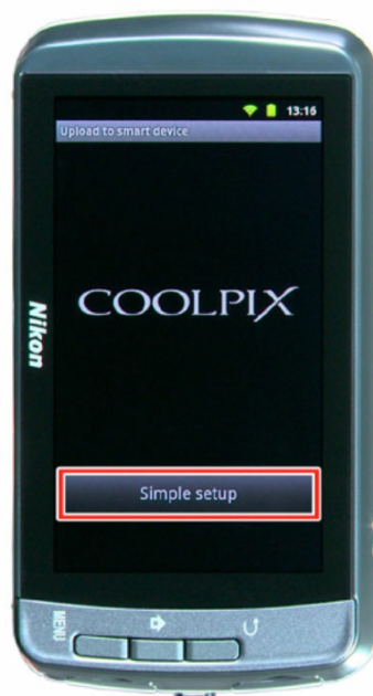
This is the Simple setup screen on the COOLPIX S800c.