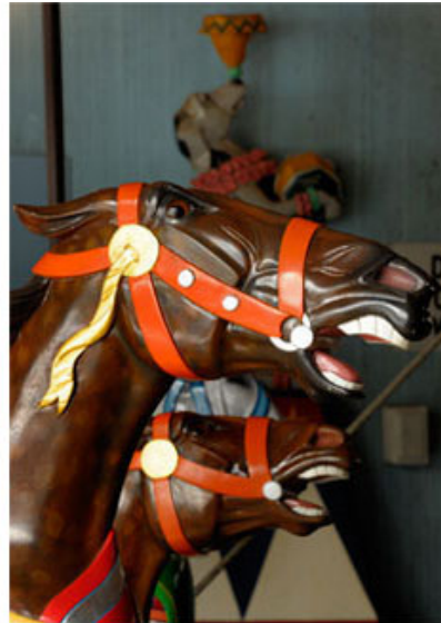
Aperture set at f/11 - Greater depth of field