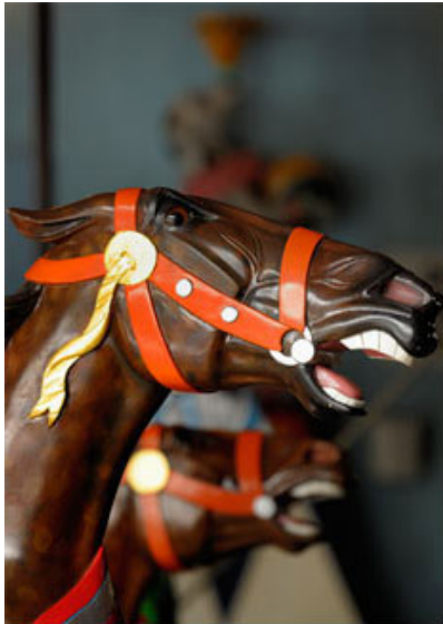
Aperture set at f/2.8 - Less depth of field