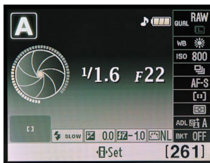
High f/stop - Small aperture - Greater depth of field