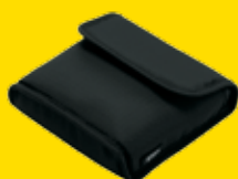
SS-SX1 Soft Case for SX-1 Attachment Ring