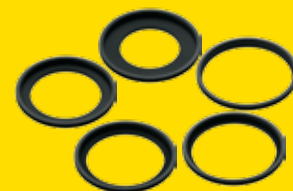
Adapter Ring Set (5 rings) (x1)