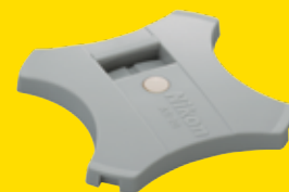
AS-20 Speedlight Stand (x2)