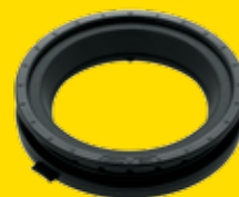
SX-1 Attachment Ring