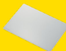
SW-12 Diffuser Panel