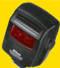
SU-800 Wireless Speedlight Commander

The R1 and R1C1 configurations of the Nikon Wireless Close-Up Speedlight System provide a comprehensive array of integrated components and accessories. With the exception of the SU-800 Wireless Speedlight Commander and SS-SU800 case, included only in the R1C1 option, the configurations are identical.