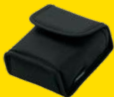
Soft Case SS-SU800 for SU-800