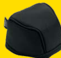
SS-R200 Soft Case for SB-R200 (x2)