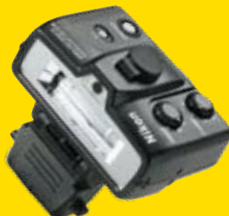
SB-R200 Wireless Remote Speedlight (x2)