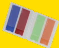
SJ-R200 Color Filter Set (4 filters in 4 models)