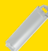
SZ-1 Color Filter Holder (x2)