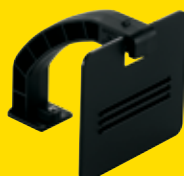
SG-3IR IR Panel for Built-in Flash