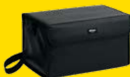
SS-MS1 Close Up Speedlight Outfit Case