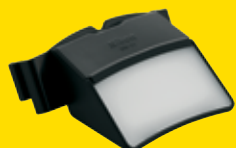
SW-11 Extreme Close-Up Positioning Adapter for SB-R200 (x2)