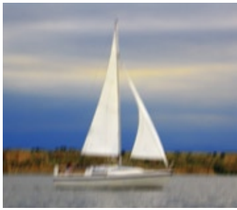
without vibration reduction