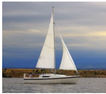
with vibration reduction

Nikon's VR Optical Image Stabilization system compensates for camera shake to produce clearer, sharper results in lower light or unsteady conditions. Active full time, VR's stabilizing effects also aid in smooth, easy framing and shooting.