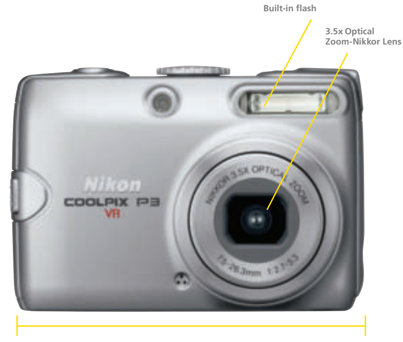
Actual size 3.6"W x 2.4"H x 1.2"D (only 5.9 oz!)