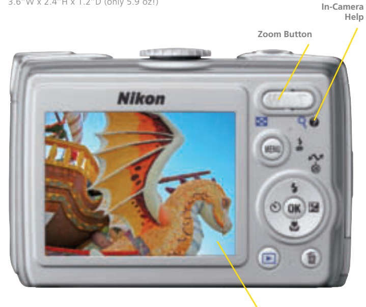
Incredible, Bright 2.5" LCD Monitor for high visibility in daylight