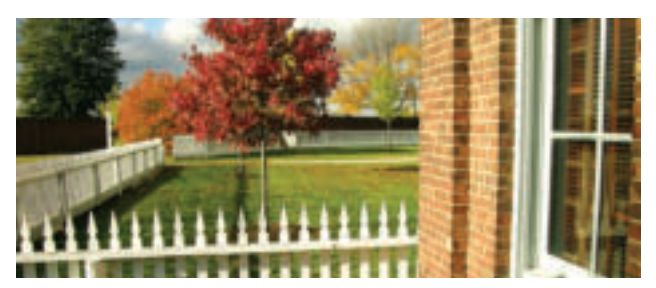
256-Segment Matrix Metering system enables optimal exposures in challenging lighting situations

Enjoy the power of the 3.5x optical zoom lens, 36-126mm (35mm equivalent), plus 4x digital zoom equals 14x zoom range. Macro capability lets you get as close as 1.6 inches. This combination is supported by Nikon's world renowned optical technology delivering clear, crisp images backed by stabilizing VR assurance.