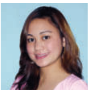
In-Camera Red-Eye Fix<sup>™</sup>

This in-camera feature automatically fixes most occurrences of red-eye. You may never see red-eye again.